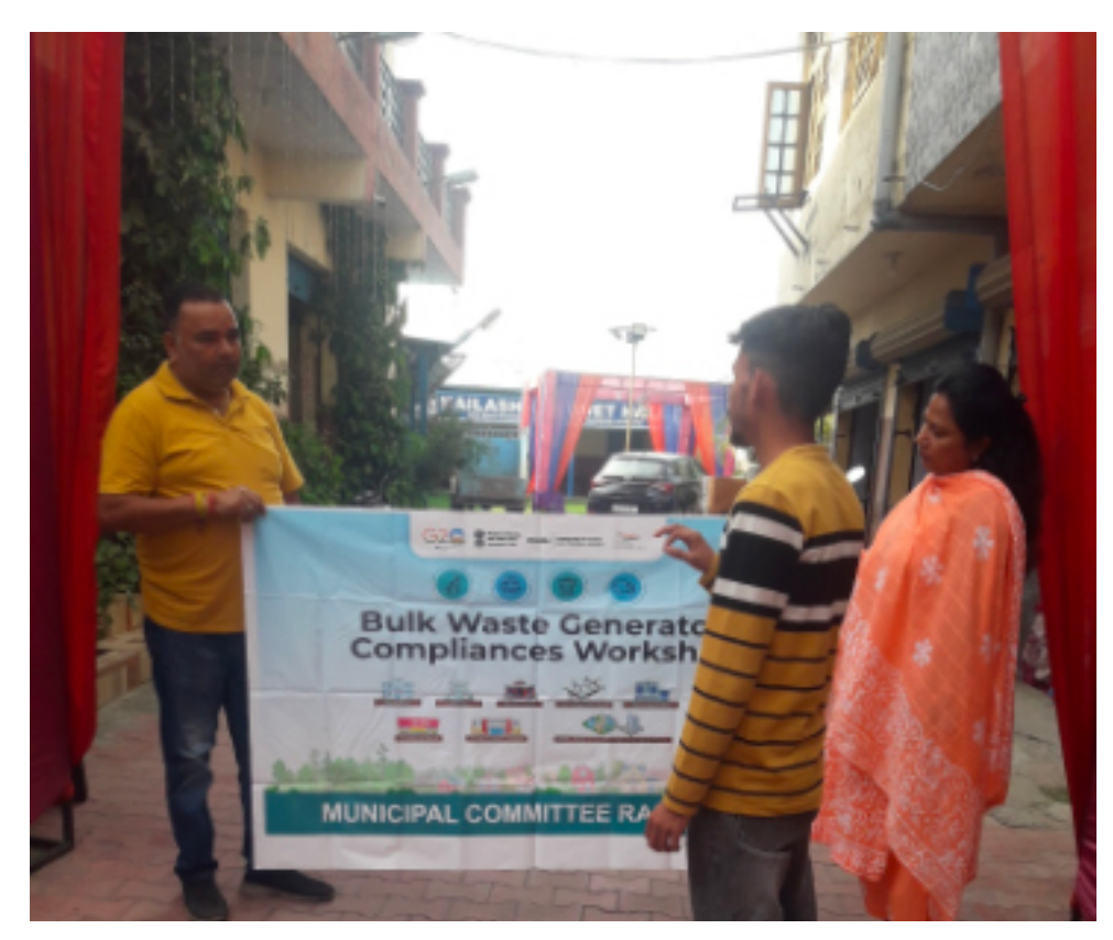
IEC TEAM DURING THE WORKSHOP WITH BULK WASTE GENERATORS

The workshop was a success and helped to raise awareness of the importance of compliance with The workshop was attended by The workshop participants learned bulk waste generator regulations. representatives from businesses and about the importance of proper The participants were grateful for organizations that generate large waste management and the benefits the opportunity to learn more quantities of waste The workshop of compliance with bulk waste about the regulations and how to