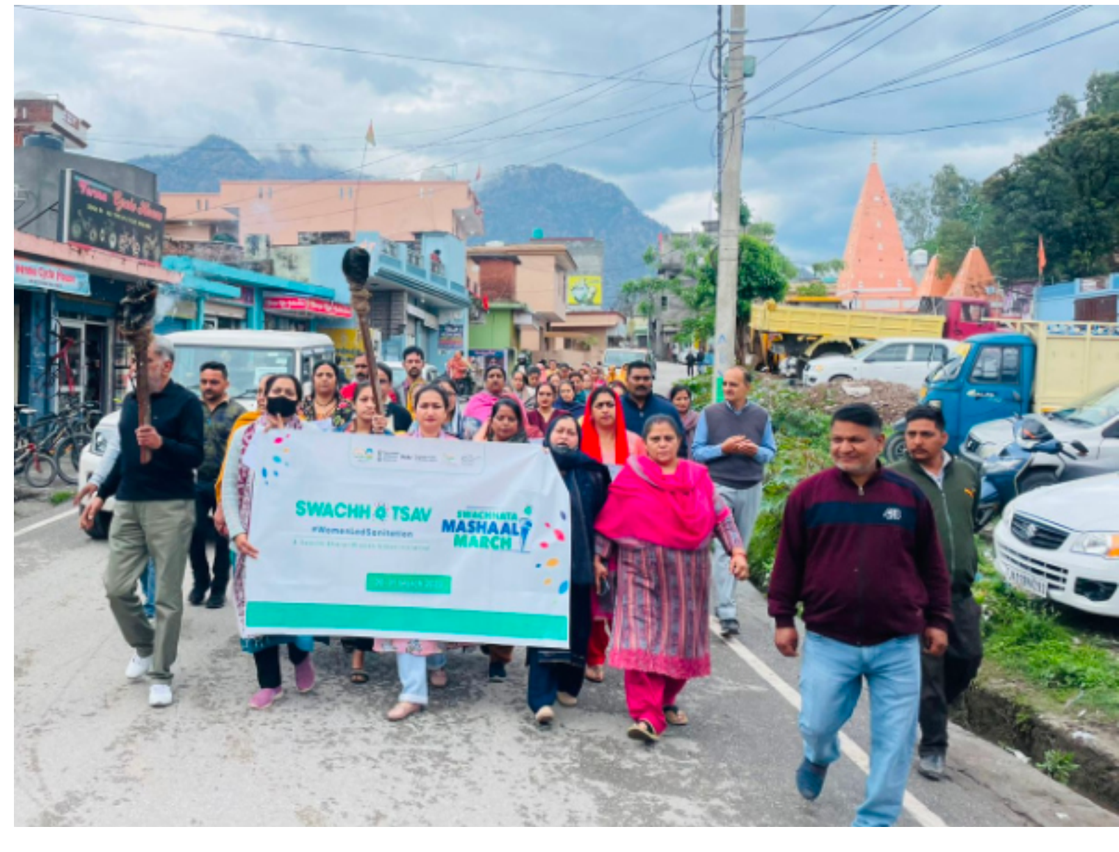
EMPOWERED WOMEN LEADING THE WAY: SWACHH MASHAAL MARCH IGNITES CHANGE IN JAMMU, UNITING COMMUNITIES FOR A CLEANER FUTURE.

The Swachh Mashaal March witnessed the active participation of political representatives, further reinforcing the commitment of local governance in achieving cleanliness targets. The presence of political leaders not only demonstrated their dedication to the cause but also set an example for citizens, urging them to actively